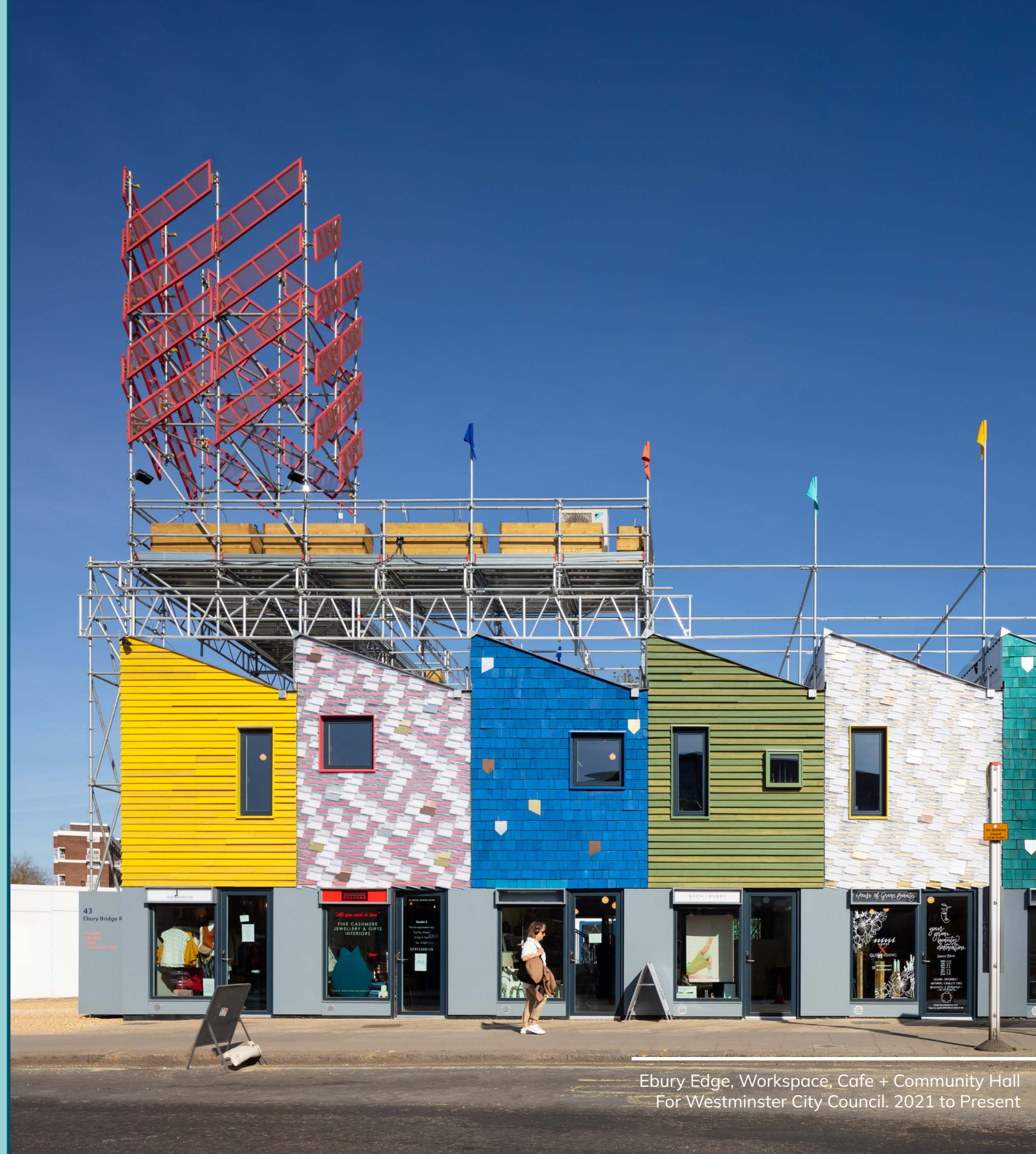
Ebury Edge, Workspace, Cafe + Community Hall For Westminster City Council. 2021 to Present

We partner with local authorities, property owners and communities to co-create vibrant, sustainable places that deliver lasting impact. With an award-winning track record, we ensure measurable value at every project stage.